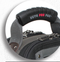
Webbed Handle, Overmoulded Grip