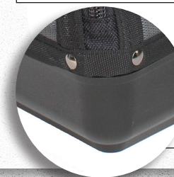
Durable, 3mm Waterproof Base