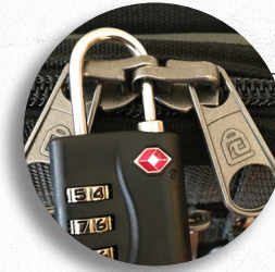
YKK® Locking Zippers