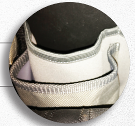
Neoprene Pockets for Meter Protection