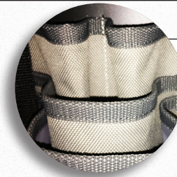
Light Gray Pockets for Better Visibility