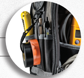
Electrical Tape Strap